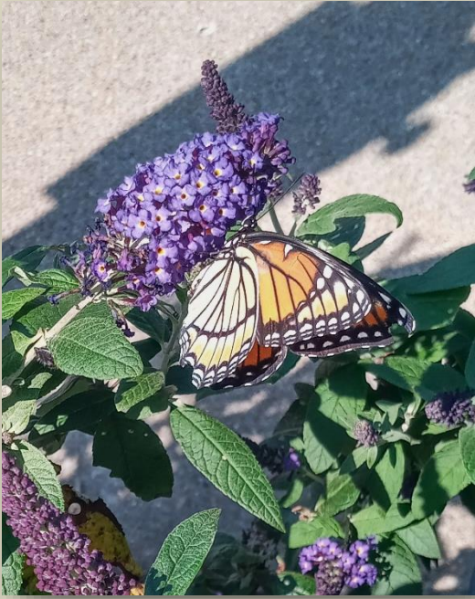
Monarch on Butterfly Bush ( Buddleia spp.)

All Milkweeds are perennials, except Tropical Milkweed, an annual in our region. The most