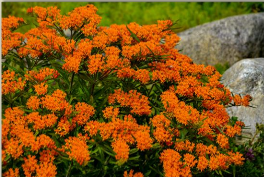
Butterfly Weed ( Asclepias tuberosa )